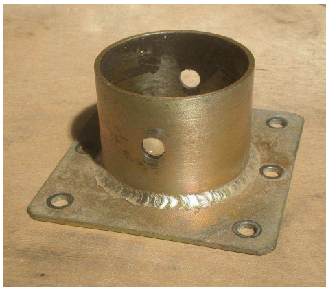
Fig. 1: Flange without strengthening ribs

Determine whether a flange with or without four strengthening ribs is mounted on the front landing gear. The two modifications of the flange are shown in the pictures below.